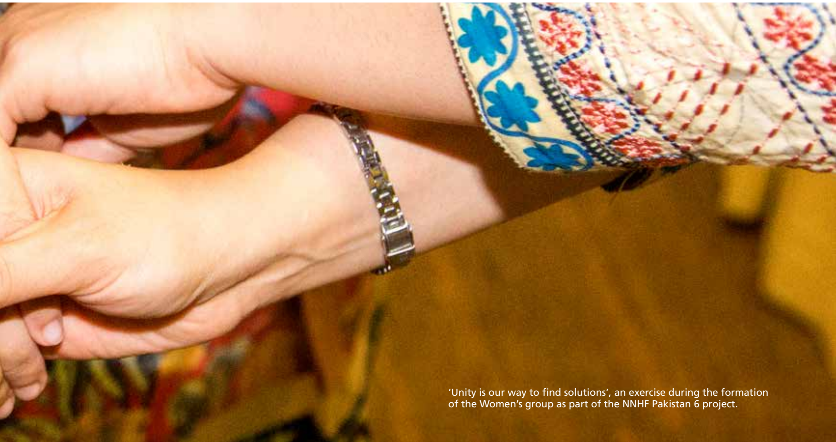
'Unity is our way to find solutions', an exercise during the formation of the Women's group as part of the NNHF Pakistan 6 project.

Our grassroots approach is aligned with the United Nations Sustainable Development Goals. We refer to these goals when, together with our partners, we plan, monitor and assess how our programmes lead to a sustainable future for haemophilia care in the countries in which we operate. For examples of how our programmes are meeting these goals, see the results of our latest impact assessment.